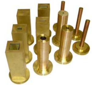
Supplied Collimator Set

Volumetric Imaging Resolution: 0.2 mm (nominal) Volumetric Field of View: 100 mm diameter cylinder of 100 mm length Minimum Acquisition Time: 20 seconds CT Noise: 50 HU at 0.2 mm voxel resolution Geometric Linearity: 0.5 mm over 100 mm Typical Imaging Dose: 1-10 cGy (center of 30 mm subject)