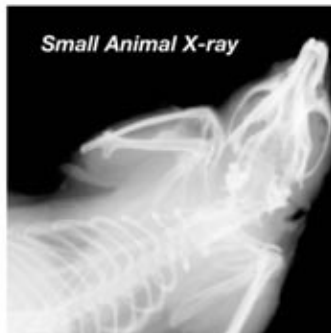
Small Animal X-ray

The INSIGHT 40 SM is simple to operate. Its compact size, low weight, and standard AC power requirement allow it to be conveniently located and operated in a laboratory or in the field.